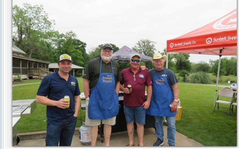
ABC Members EVCO and Sunbelt Supply at the ABC 34th Annual Golf Classic

Enjoy fun and games, and meet other players in local business and industry at the ABC Poker Tournament