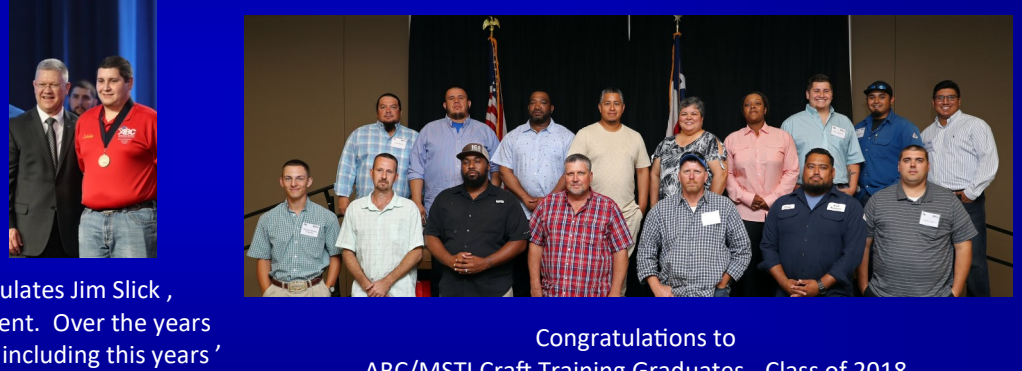
Congratulations to ABC/MSTI Craft Training Graduates - Class of 2018