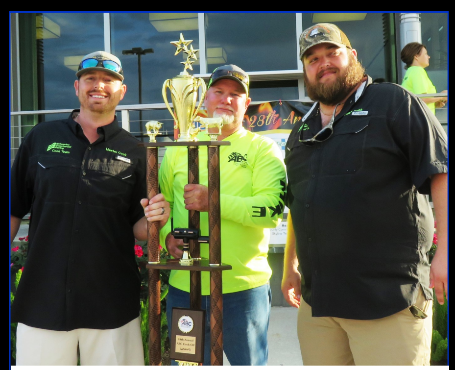
Enterprise Commercial Paving - Overall Champions