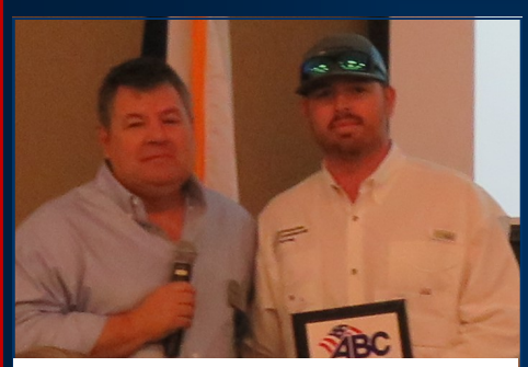
New Member Enterprise Commercial Paving