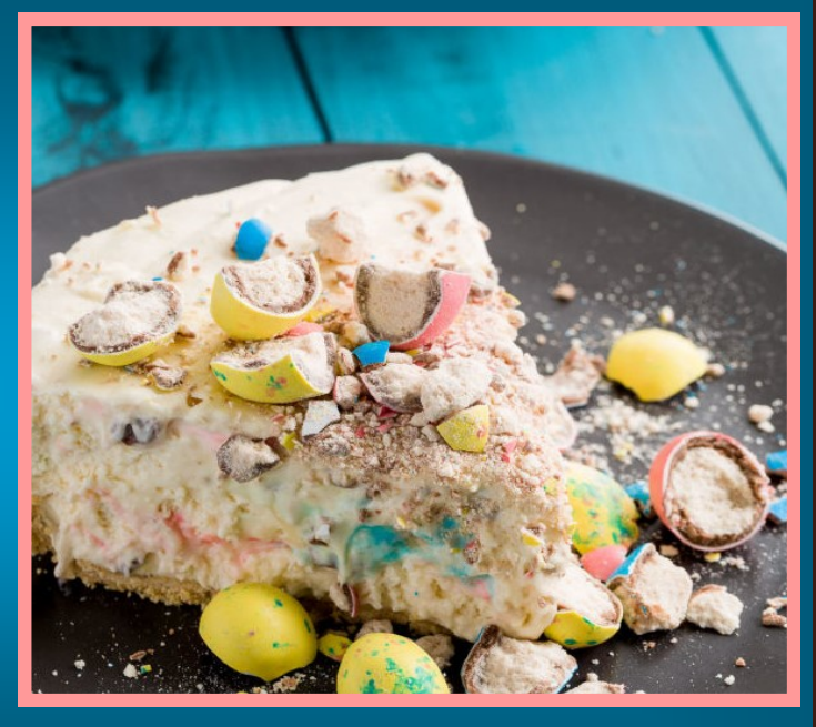
Recipe adapted from delish.com.