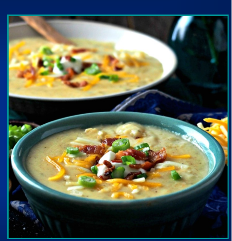
Recipe & picture adapted from www.simplysated.com

To serve, pour soup in bowls and top with bacon, dollop of sour cream, green onions, extra cheese and crackers.