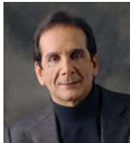
Charles Krauthammer political commentator