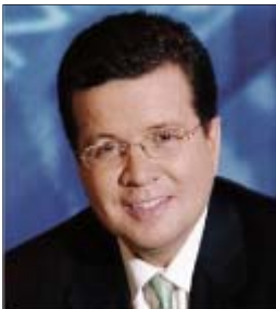
Neil Cavuto business and financial expert

Hear from these nationally recognized authorities: