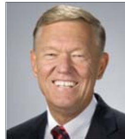
Barry Asmus national economist