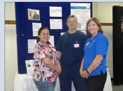
Expertox-All American Screening

The Mixer offered great networking featuring the following