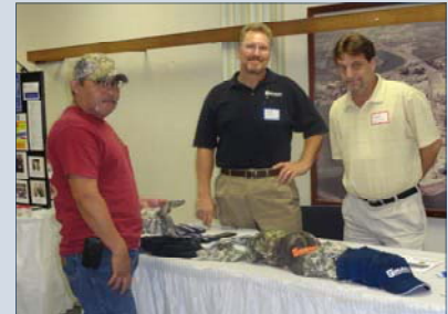
Summit Electric Supply