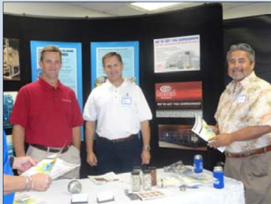
Sparkling Clear Industries

The ABC Suppliers' Council Committee hosted the Supplier/Member Mixer and Competent Person Excavation Safety training on Thursday, October 6th at the ABC facilities.